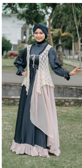
Fig. 6. Party Dress