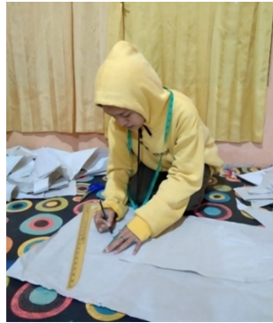
Fig. 2. Clothing Pattern Making Process