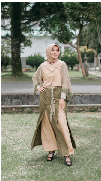
Fig. 7. Casual Party