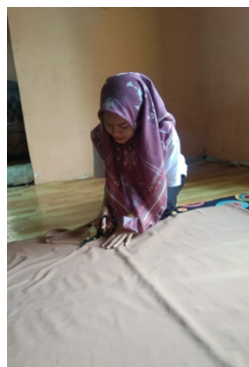
Fig. 3. Fabric Cutting Process