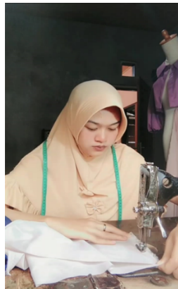
Fig. 4. Sewing Process