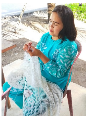
Fig. 5. Crochet Process