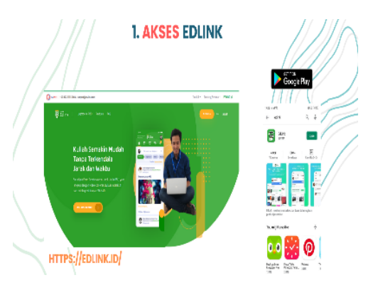
Figure 2. Display of Edlink Acces