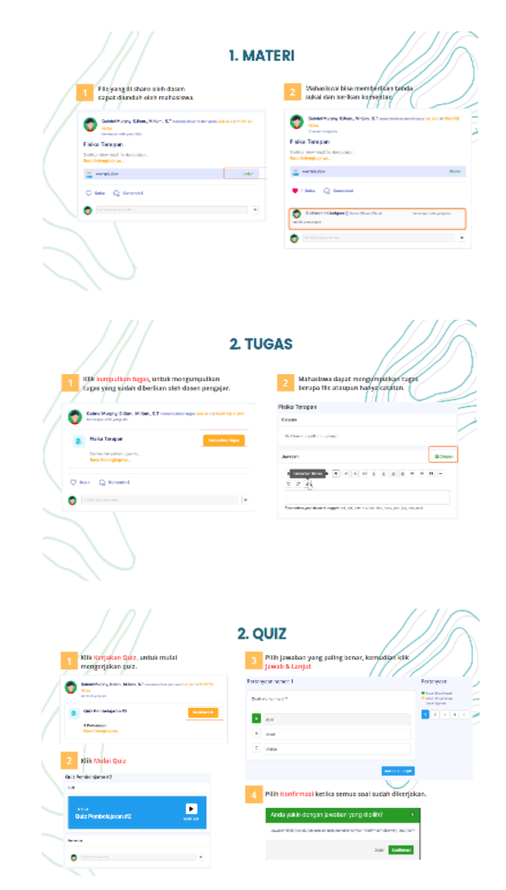
Figure 7. Display the way to download and upload lecture material, tasks, and quizzes.

Accessing, logging in, and displaying the student homepage is similar to how the lecturer appears. Here are some perspectives on material downloading, task collection, etc