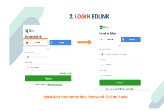
Figure 3. Display of LOGIN EDLINK