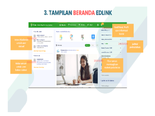
Figure 4. Display the Homepage of Sevima Edlink.