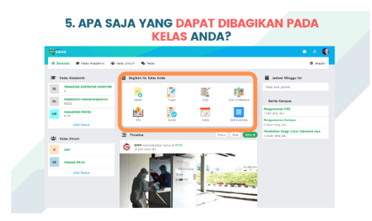
Figure 5. The activities can be done in class using Sevima Edlink.