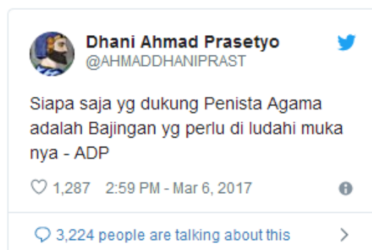
Figure 2. The Second Twitter of Ahmad Dhani

The next article is on Ahmad Dhani's tweet; " Siapa saja yg dukung Penista Agama adalah Bajingan yg perlu di ludahi mukanya-ADP " (Anyone who supports Blaspheming Religion is a miscreant who needs to spit in his face – ADP). The Semantic lexical meaning: